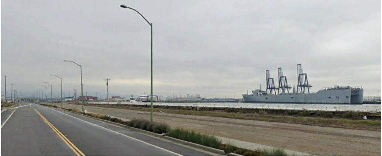
Figure 13: Viewpoint 3

View of tugboats at Berths 8/9, Government Lay berth Vessel at Berths 9 and 20, and the Outer Harbor and Marine Terminals from the Judge John Sutter Shoreline Park Bridge Yard Building and Observation Deck at Burma Road, looking east.