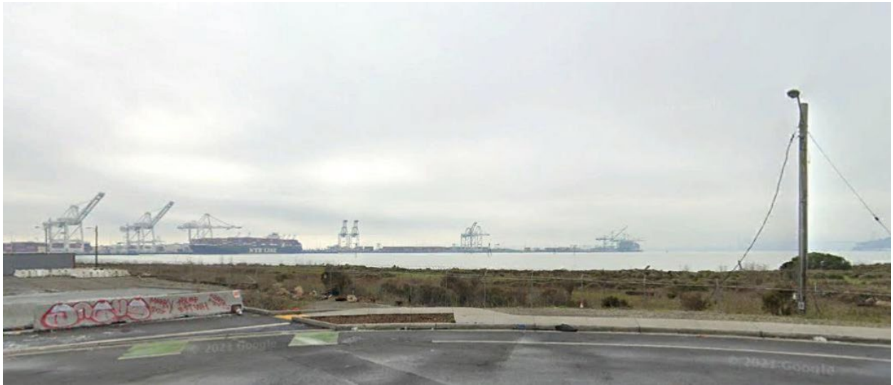
Figure 12: Viewpoint 2

View of the Outer Harbor Turning Basin and Port Marine Terminals from the Judge John Sutter Shoreline Park (Gateway Park) entrance, looking south.